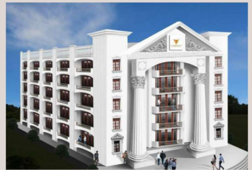
White Pearl @ Mysore Road