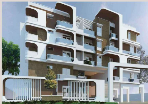
Advaita @ Yeshwanthpur