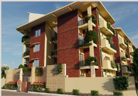
Agastya @ Tumkur Road